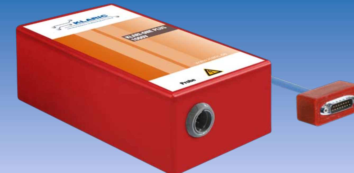
KLARI-ONE PLUS 1000V, 2 channel