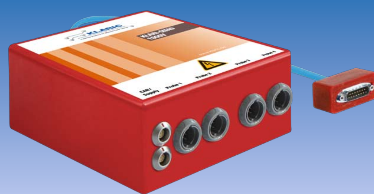
KLARI-QUAD 1000V, 4 channel